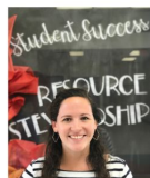
WSHS 23-24 COUNSELORS